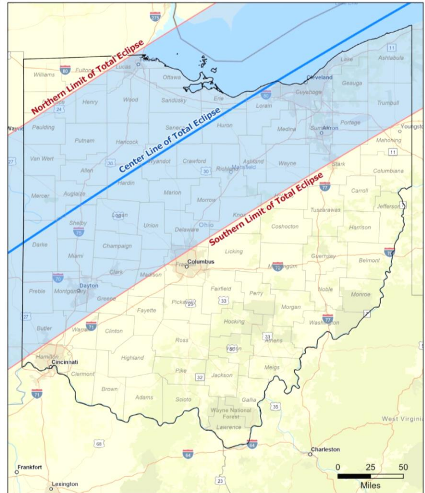
Total Solar Eclipse Path through Ohio April 8, 2024